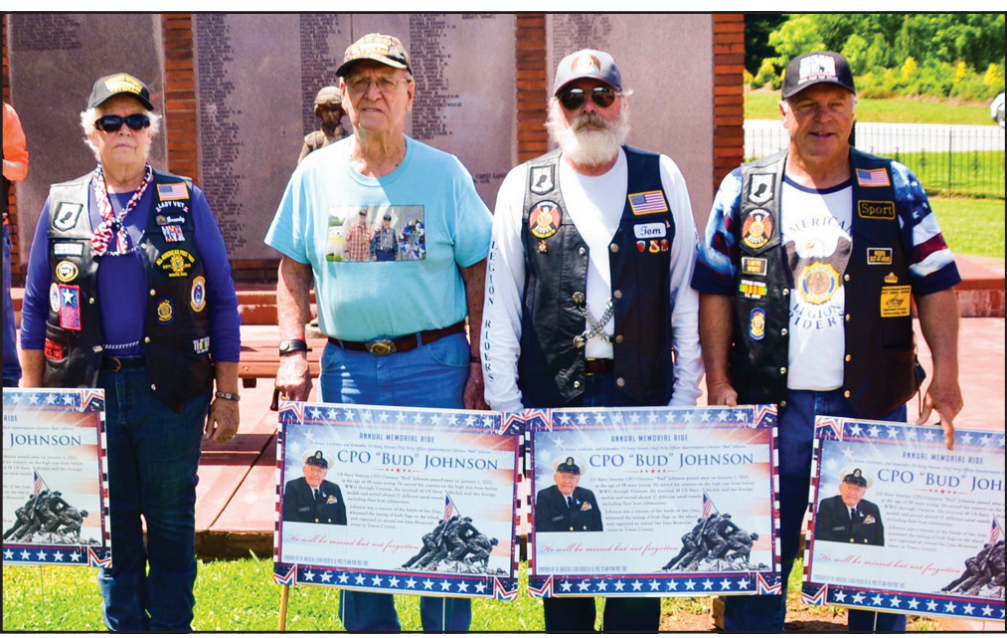
Local veterans donned their patches and hopped on their motorcycles in support of the First Annual Bud Johnson Memorial Ride Saturday.