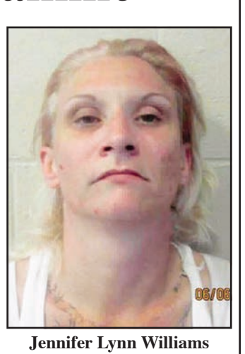
a false name, possession of a Schedule II controlled substance, possession of

being charged with possession of drug-related objects, damage to government property, drugs not in original container, trafficking in methamphetamine, giving